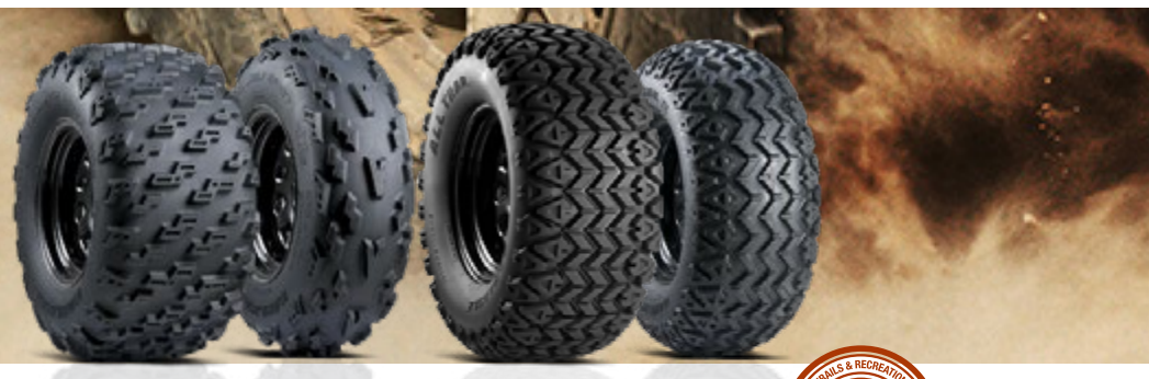
TRAIL WOLF SPORT REAR TRAIL WOLF SPORT FRONT