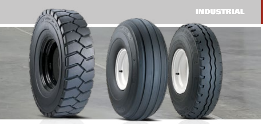
PREMIUM WIDE TRAC