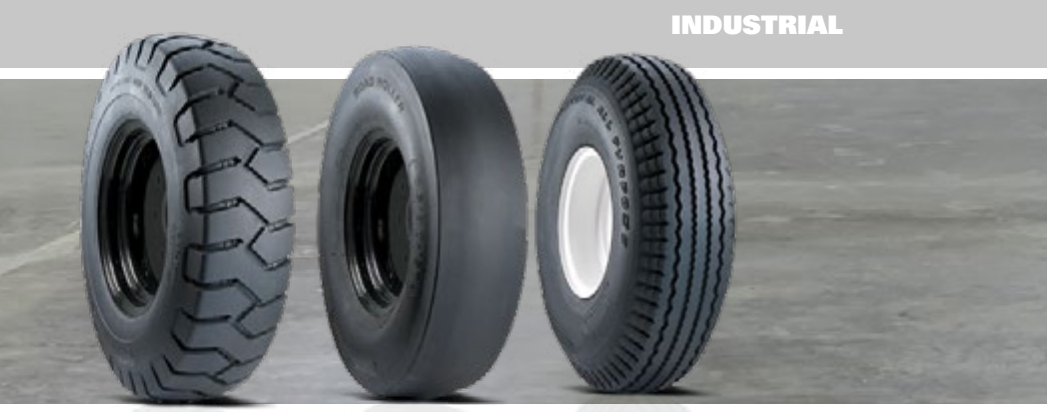
INDUSTRIAL DEEP TRACTION