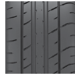
SP SPORT MAXX GT 600 TREAD PATTERN