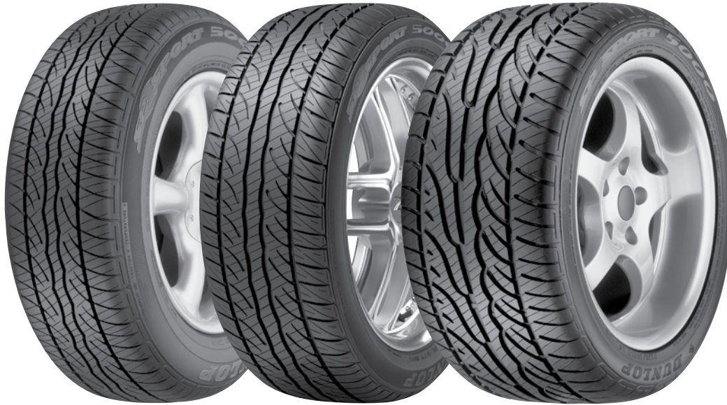
TREAD PATTERN FOR MATERIAL #193265 ONLY†