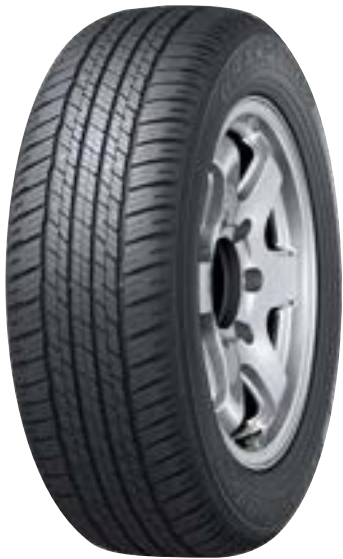
GRANDTREK AT23 TREAD PATTERN

Original Equipment All-Season Truck and SUV Tire