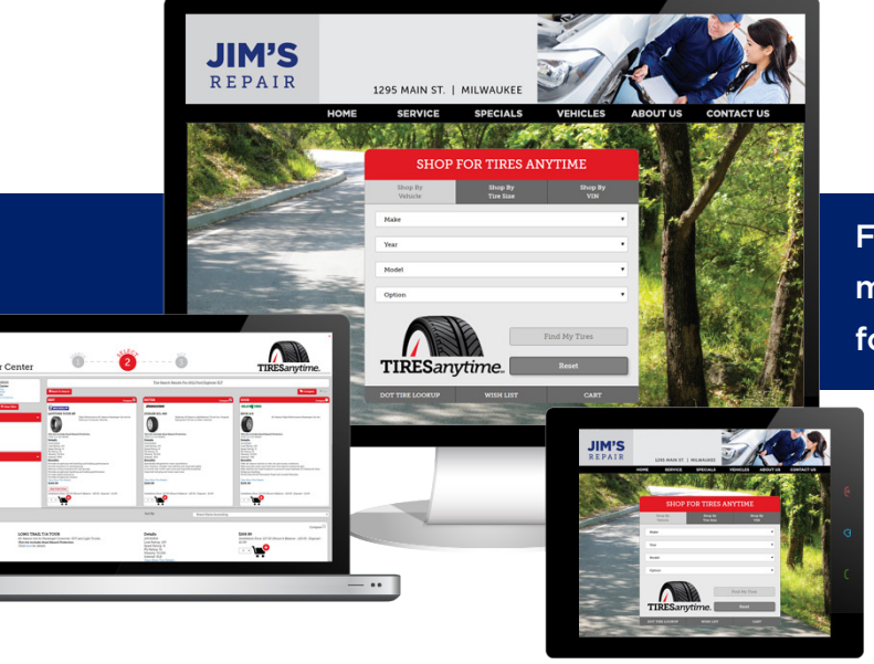
Fully responsive mobile experience for consumers